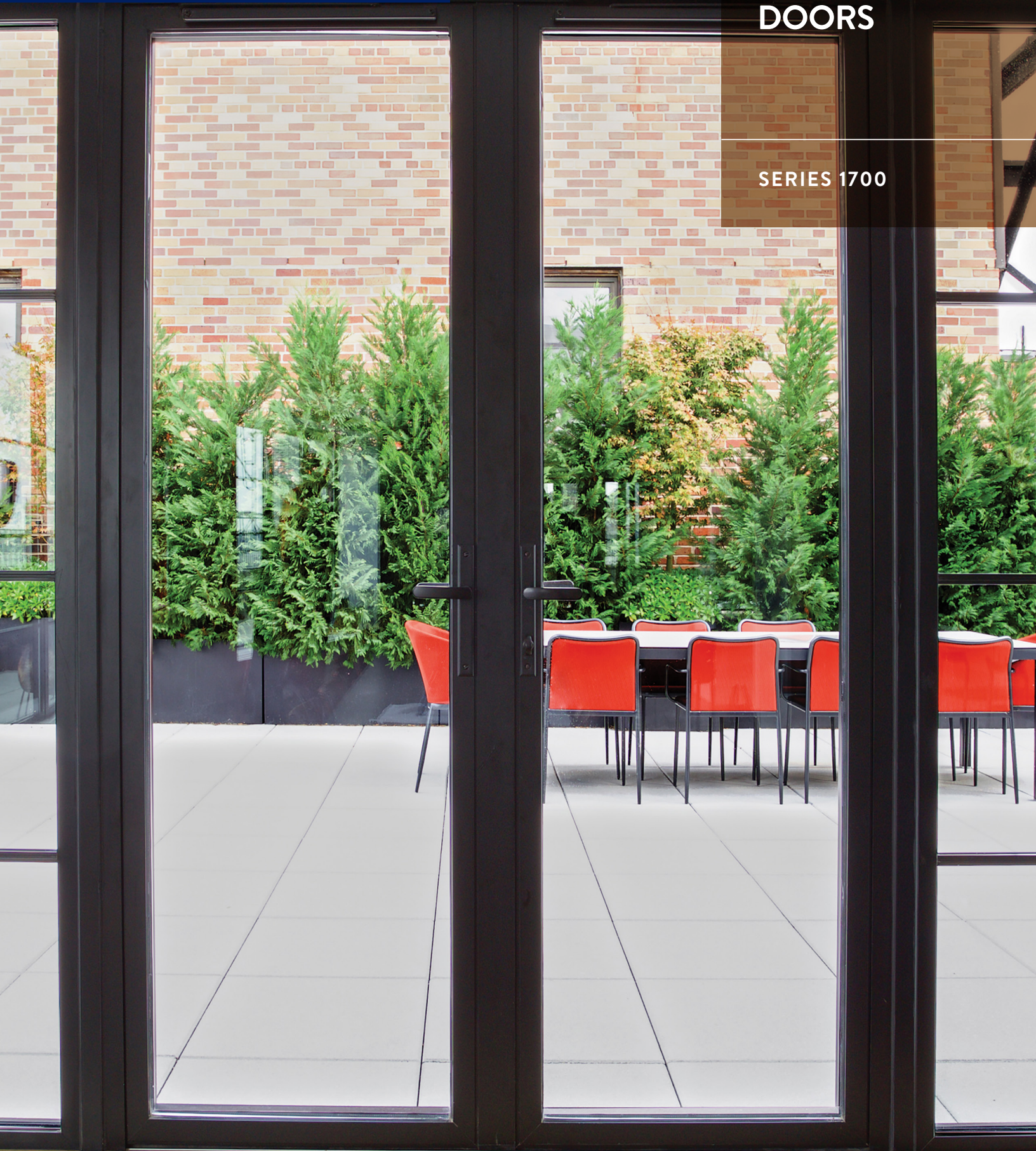
Shown with non-standard handles